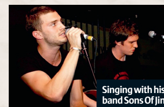
Singing with his band Sons Of Jim