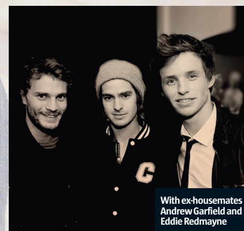
With ex-housemates Andrew Garfield and Eddie Redmayne