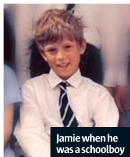
Jamie when he was a schoolboy

So, whip yourself into shape for the inevitable Christian Grey-focused water cooler chats with our favourite facts about Jamie.