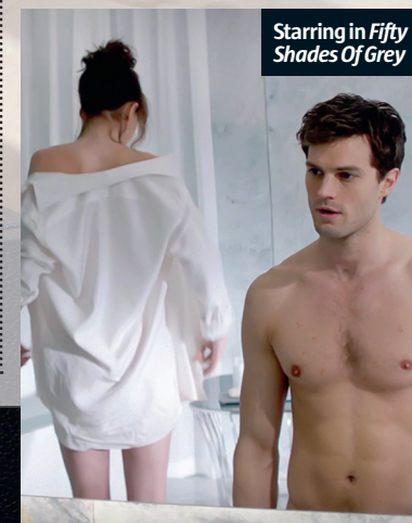
Starring in Fifty Shades Of Grey

To prepare for Fifty Shades , Jamie went to some dark places (literally and figuratively): 'This guy came along with his submissive and I sat in the corner with a beer and watched.'