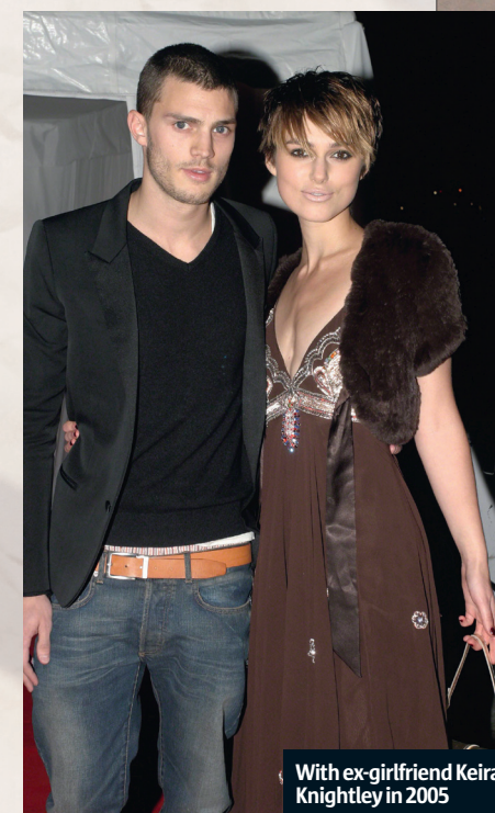
With ex-girlfriend Keira Knightley in 2005

Jamie dated Keira Knightley from 2003 to 2005 after meeting her on a shoot for Asprey. He's spoken about how press intrusion into Keira's life shocked him. 'I don't think I'm ever going to be as famous as her,' he said. Famous last words.