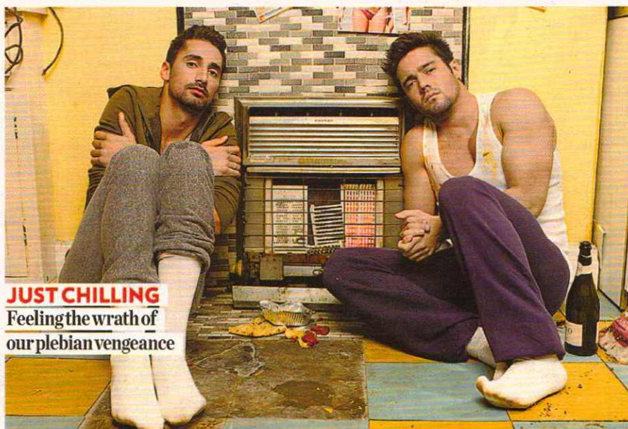
JUST CHILLING Feeling the wrath of our plebian vengeance

S: Incredibly. I'd just started my new job